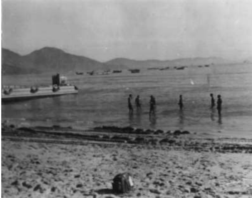
UDT 12 members on Red Beach, Danang, South Vietnam, prior to the landing of the 2nd Battalion, 3rd Marines, 10 April 1965.