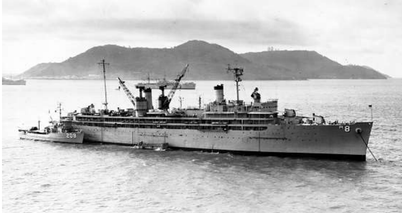
Repair ship USS Jason (AR-8) at anchor off Vung Tau in 1968 with a nest of small ships moored to port and the coastal minesweeper USS Woodpecker (MSC-209) moored starboard aft while refueling.