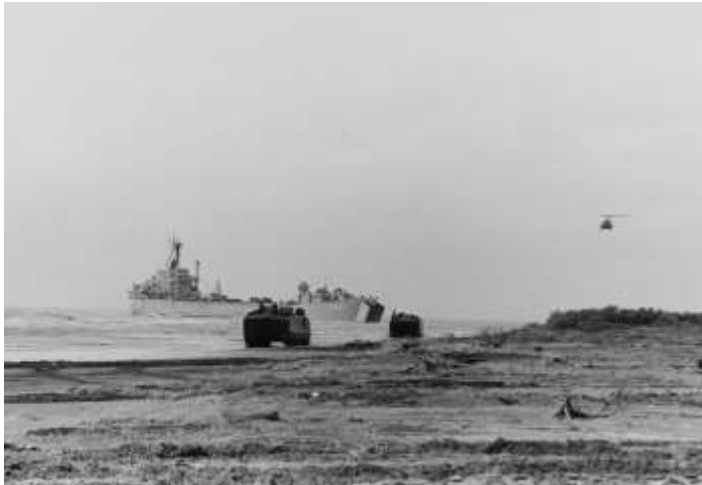
USS Washtenaw County (LST-1166) with her bow doors open to launch amphibious craft in support of Operation DECKHOUSE V. Two Marine Corps amphibious tractors are moving along the beach, with a UH-1 helicopter approaching, at right.