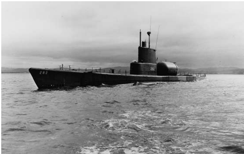
Guided missile submarine USS Tunny (SSG-282) off the Mare Island Navy Shipyard, 16 April 1953. She was converted to a troop-carrying submarine in 1966 (APSS-282), and reclassified an amphibious transport submarine (LPSS-282) on 1 January 1969.

Three high speed transports— Alex Diachenko (ADP-123), Cook (ADP-130), and Weiss (ADP-135)—also delivered and recovered beach reconnaissance teams, albeit not as stealthily as by transport submarine.