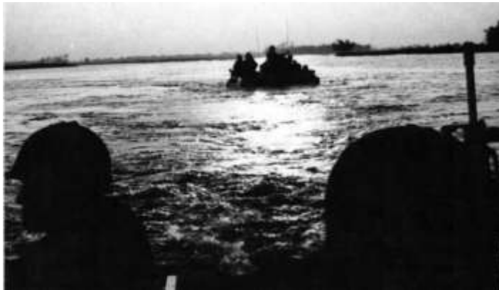
3rd Marine Division Amtraks shuttle supplies to forces conducting clearing operations along the Cua Viet River supply route, 1968. Marine Corps photograph A191224