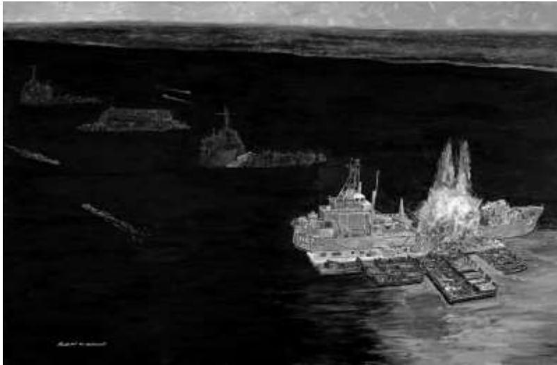
Painting by Richard DeRosset, depicting a Viet Cong swimmer-sapper mining attack on the tank landing ship USS Westchester County (LST-1167), on 1 November 1968, in which the U.S. Navy suffered its greatest loss of life in a single incident, as a result of enemy action, during the entire Vietnam War.