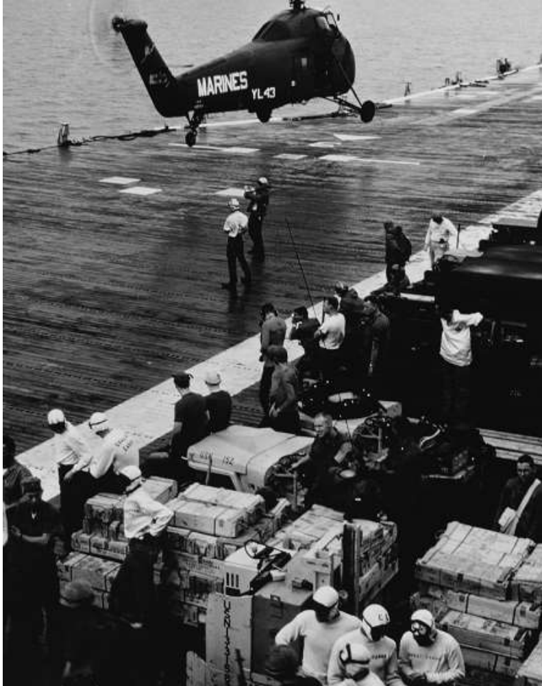
Marine UH-34 helicopter taking off from the flight deck of the amphibious assault ship USS Princeton (LPH-5) to land Marines in the Vietcong-saturated Rung Sat Zone in South Vietnam, 26 March 1966. The landing was part of Operation JACKSTAY.