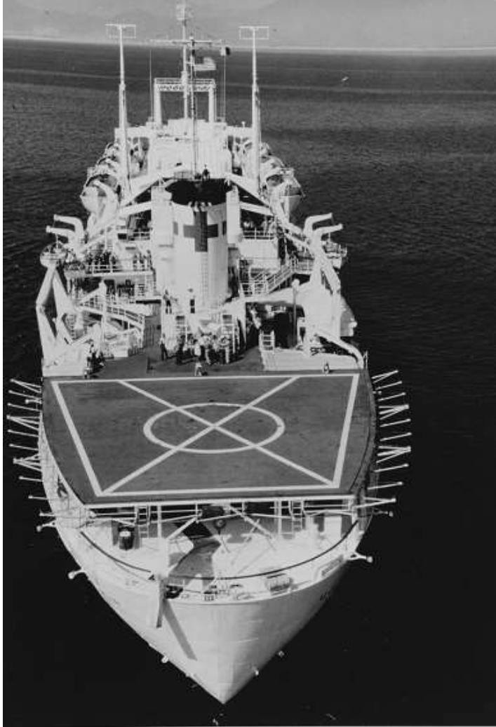
Hospital ship USS Repose (AH-16) off the South Vietnamese coast, 22 April 1966. Equipped with a heliport astern, medical staff, and advanced medical facilities, she was credited with saving many lives during the Vietnam War.

Naval personnel also supported the Marine Special Landing Force as medical corpsmen, chaplains, and spotters in 1st Air Naval Gunfire Liaison Company detachments. Underwater Demolition Team, SEAL, and Beachmaster units supported operations on shore. 6