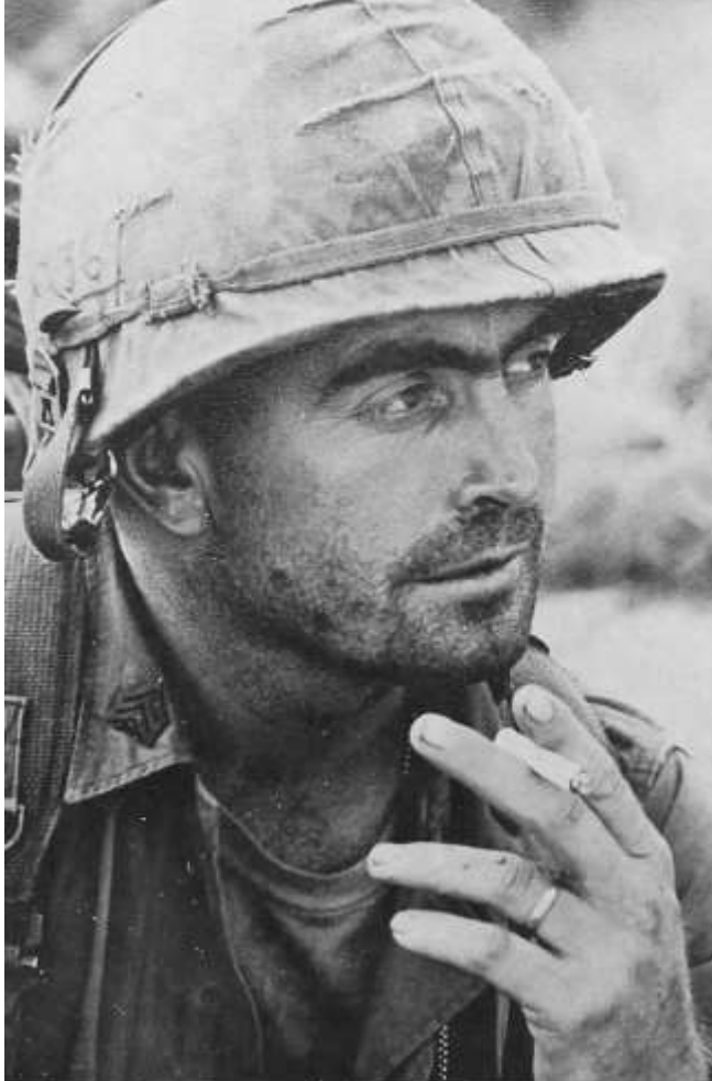
Unidentified member of a Battalion Landing Team. USS Valley Forge (LPH-8) Western Pacific 1965-1966 cruise book

The Marine SLF included a medium helicopter squadron equipped with twenty-four UH-34s embarked in the amphibious assault ship. The ground combat element, an infantry battalion landing team, reinforced with artillery, armor, engineer, and other support units, were divided among the ships. This practice enabled landings of men and their equipment on shore by helicopter, or by the forty-one tracked landing vehicles (LVTs) carried aboard the ships, or by both methods. The LVTs were commonly called “Amtraks.” 4