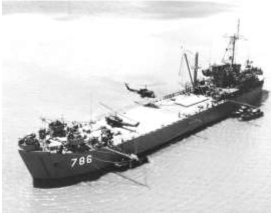
Garrett County (LST-786) on the Co Chien River, Mekong Delta, South Vietnam. A naval UH-1B helicopter is landing on her deck, and three PBR Boats are alongside, June 1968.

Chapters 8, 10, and 13 are devoted to the Mobile Riverine Force, River Patrol Force, and SEA LORDS Campaign, and the involvement of “amphibs” (primarily LSTs) with these forces. Four of the most highly decorated tank landing ships— Garrett County (LST-786), Harnett County (LST-821), Hunterdon County (LST-838), and Jennings County (LST-846)—served as mobile support bases for river patrol boats and helicopters on the rivers of the Mekong Delta. Garrett County is not listed in the earlier table because the ships are rank-ordered by number of combat action ribbons earned. However, in addition to her two CRs, she was notably awarded a Presidential Unit Citation, and six Navy Unit Citations. One of these citations may be found in Appendix C.