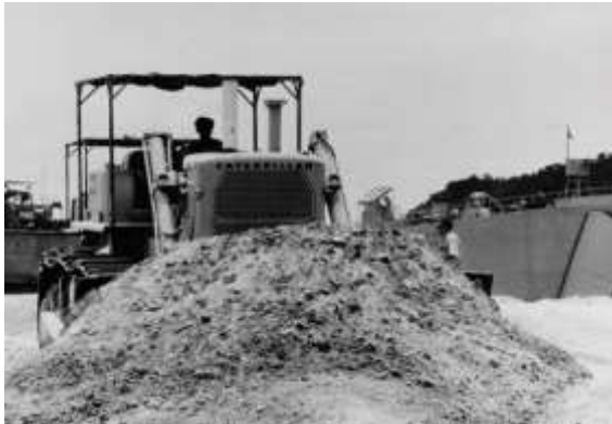
Preparation of a new ramp as LSTs approach to offload at Vung Tau.